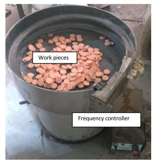
Figure-1.Vibratory bowl feeder

Figure-1 shows the setup which consists of a hopper which is a container into which the components are loaded in bulk i.e. the parts are initially randomly oriented. A feed track is used to move the components from the hopper to the location of the assembly work head maintaining proper orientation of parts during the transfer. Here the powered feed track uses vibratory action to force the parts to travel along the feed track towards the assembly work head.