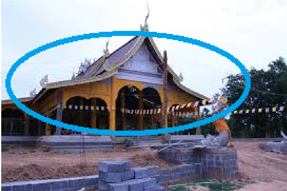
A. Wat Kokprasat, Chumni District, Buriram province